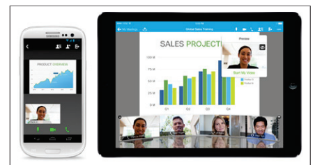
Figure 3. Meet from Any Device

Enjoy a rich meeting experience with audio, video, and content sharing across Android, iPhone and iPad, BlackBerry 10, and Windows Phone 8 devices.