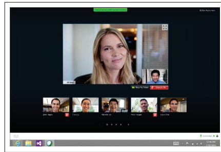
Figure 2. View of Full-Screen Mode

Make it even easier for others to join you in your Personal Room through the WebEx Video Bridge. People can join your video conference through any standards based video system.